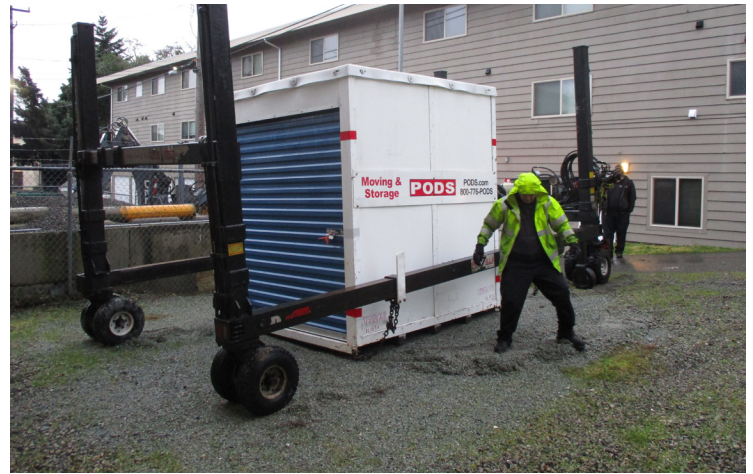
Collections materials from Friends of the Burlington Northern Railroad (FOBNR) arrived at the archives in a POD container, which was delivered to the back of the building and unpacked by PNRA volunteers and representatives from FOBNR.

General Manager, Vice-President and President.