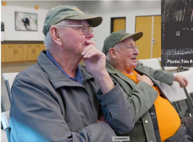
Northwest News Q1, 2024

A follow-up seminar is scheduled for May of this year.